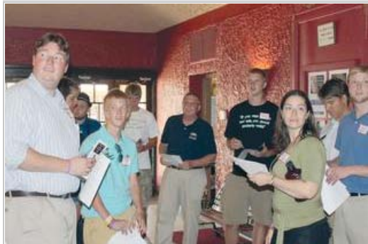
Youth Advisory Committee members are walking down Main Street in Ionia with young professionals from Grand Rapids. The participants toured the Ionia Community Library and the Ionia Theatre as well to see what made Ionia a Cool City, and what makes the city unique.